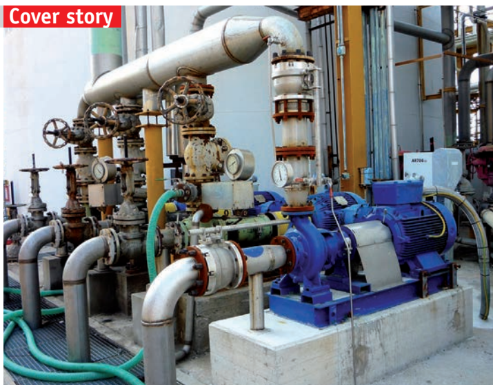
RD pump (ISO 5199) installed in a urea plant

provements to our corporate organization: today we have around a dozen individuals in house who have key roles and act autonomously. Above all, they 'are made in our mould', which is to say they are absolutely correct, furnish reliable data, and respect competitors."