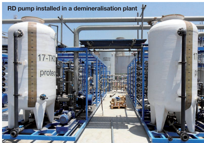
RD pump installed in a demineralisation plant

provements to our corporate organization: today we have around a dozen individuals in house who have key roles and act autonomously. Above all, they 'are made in our mould', which is to say they are absolutely correct, furnish reliable data, and respect competitors."