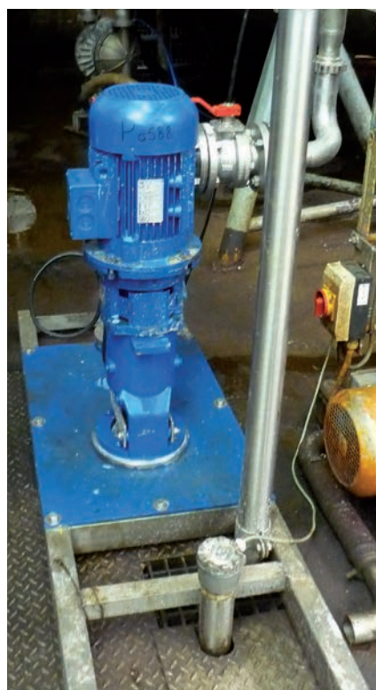
Cantilever pump for aggressive media collection

Salvatore Robuschi confirms the positive trend (10% growth on average over the past 22 years) underlying new investments aimed to increase its production capacity and strengthen its presence on the markets.