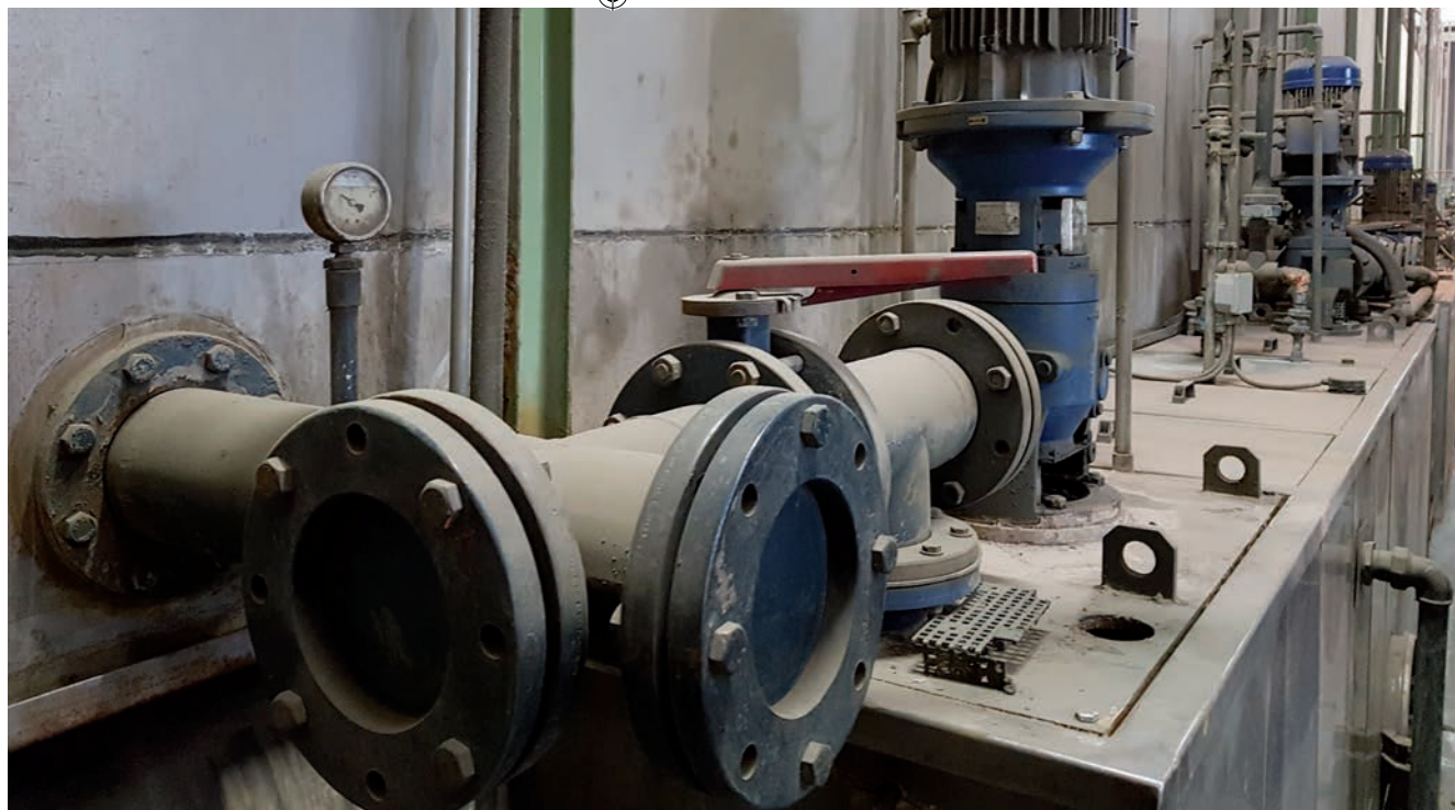
Cantilever pumps installed in metal washing and degreasing plants