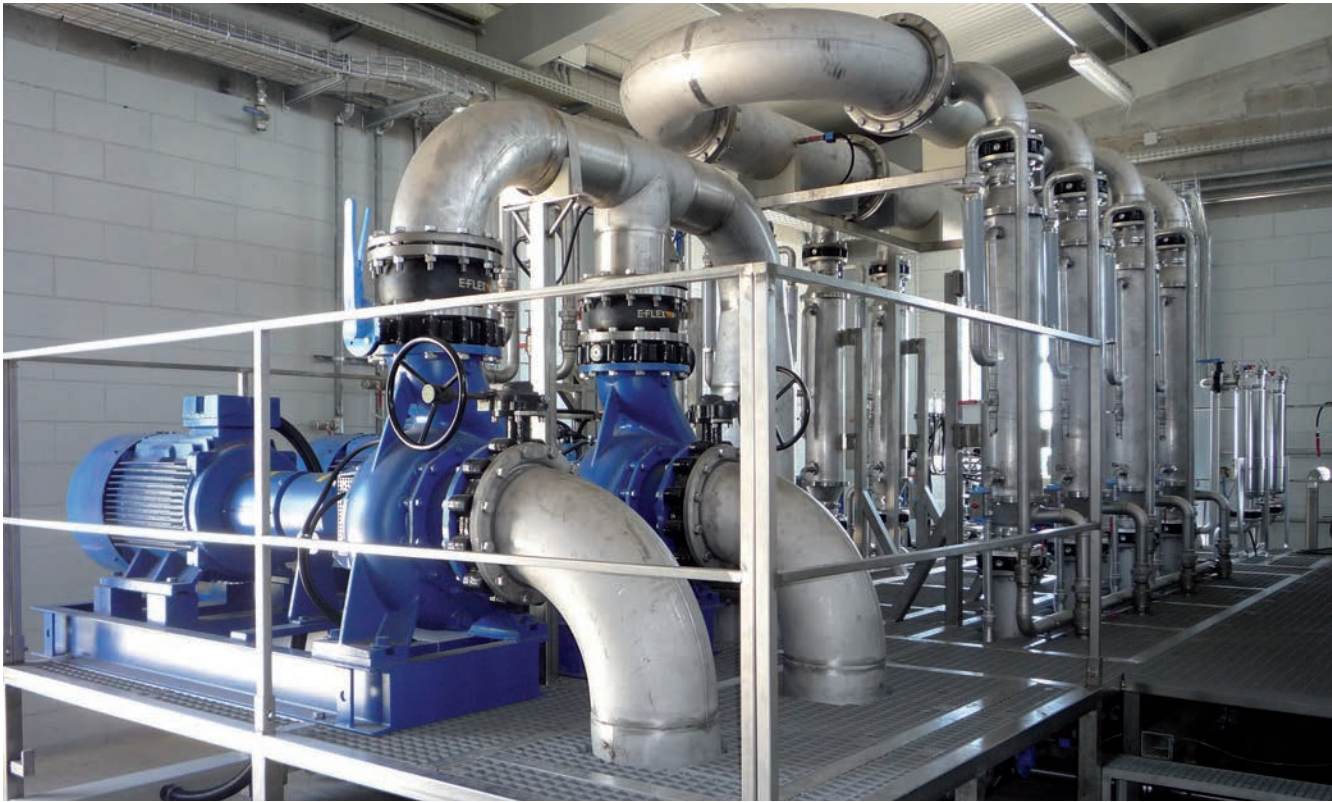
RB pump for caustic soda ultrafiltration

“2017 ended with a 16% increase in turnover, and we also saw a positive trend as regards our orders. The first months of 2018 confirmed the excellent results recorded last year and although there was a slowdown in April, in May things picked up again, both in Italy and abroad.