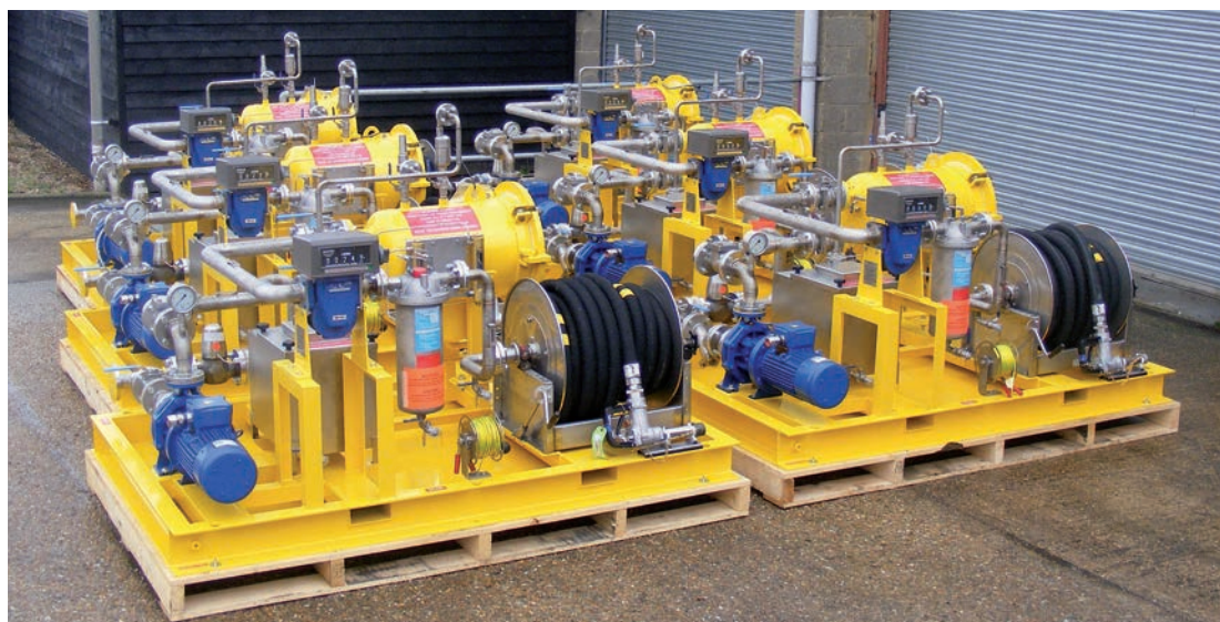
RDM pumps installed on mobile skid for jet fuel refilling

Our foreign market share is increasing, but we are also getting a very positive response on the Italian market.