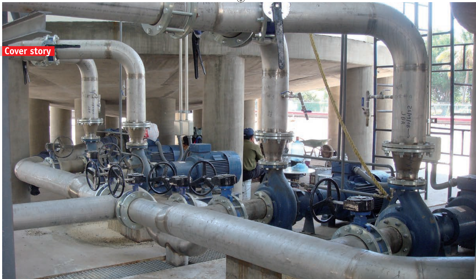
RB pump installed in a bioethanol production plant