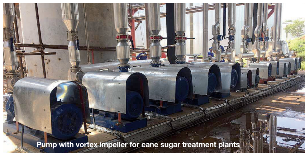
Pump with vortex impeller for cane sugar treatment plants